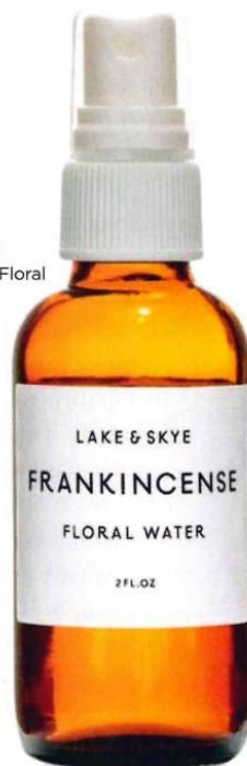
LAKE & SKYE Frankincense Floral Water, $48.

After a consultation, your wellness therapist tailors the regimen to your needs employing decadent lines like Caudalie (beloved for its age-defying serums with grape-seed extracts) and Dana Point-based vegan line Glycelene, which has developed a chardonnay body butter especially for the spa's detoxifying body wraps. For a pre-treatment ritual, start with a dry body brushing, foot bath or soothing herbal steam shower, followed by a hot stone massage and black walnut scrub, or try the HydraFacial—a combination of hydra-dermabrasion and a chemical peel with a concentrated delivery of hyaluronic acid and peptides—before heading over to the verdant gardens for the sauna and mineral soaking pool. 900 Meadowood Ln., St. Helena, 707-531-4788; meadowood.com.