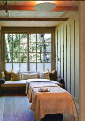
From top: The new Howard Backen-designed MEADOWOOD SPA in Napa Valley. Inside the single spa suite.